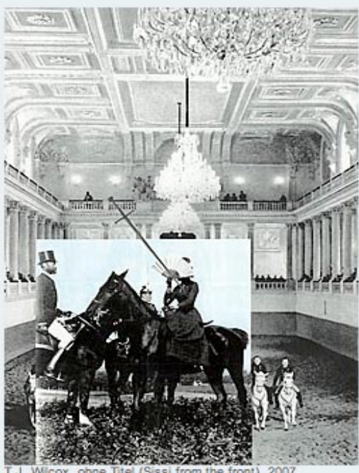
T.J. Wilcox, ohne Titel (Six Deutsche Bank Collection

Wilcox' film technique is unique, both in its complexity and its effects. He shoots a wide variety of material on Super-8, such as TV images, old advertising photographs, his own drawings, archival material, and architectural photographs. Then he digitizes the collected material and arranges and manipulates his collages according to the stories he tells in the subtitles. The last step is the conversion of the digital images onto 16-mm film. The effect of this elaborate procedure is a gradual departure from the original image that emphasizes-and even distills-the fantasy world residing in each picture. Wilcox' films are grainy; they have a historical patina, even though they seem to glow from within. His preferred palette consists of beige and brown hues as well as gradations of grey, black, and white. His recent interest in paper collage, in which he uses materials such as gouache, watercolor, ink, parts of photographs, acetate, and graphite, arose from his work designing scenes for his films. Hence the collages, such as the intertwo works from the Sissi series in the Deutsche Bank Collection, radiate a similar power of attraction. These, too, are marked by a glazed-over glamour that evokes romantic feelings of nostalgia mixed with an amused admiration.