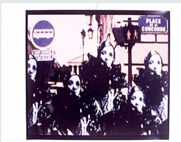
T.J. Wilcox Photograph of the film "The Funeral of Mariene Dietrich", 1999