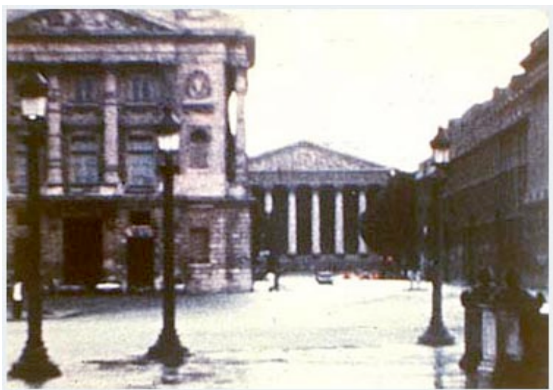
The Funeral of Marlene Dietrich, 1999 Courtesy of the Artist and Metro Pictures

Wilcox' film technique is unique, both in its complexity and its effects. He shoots a wide variety of material on Super-8, such as TV images, old advertising photographs, his own drawings, archival material, and architectural photographs. Then he digitizes the collected material and arranges and manipulates his collages according to the stories he tells in the subtitles. The last step is the conversion of the digital images onto 16-mm film. The effect of this elaborate procedure is a gradual departure from the original image that emphasizes-and even distills-the fantasy world residing in each picture. Wilcox' films are grainy; they have a historical patina, even though they seem to glow from within. His preferred palette consists of beige and brown hues as well as gradations of grey, black, and white. His recent interest in paper collage, in which he uses materials such as gouache, watercolor, ink, parts of photographs, acetate, and graphite, arose from his work designing scenes for his films. Hence the collages, such as the intertwo works from the Sissi series in the Deutsche Bank Collection, radiate a similar power of attraction. These, too, are marked by a glazed-over glamour that evokes romantic feelings of nostalgia mixed with an amused admiration.