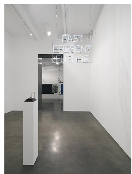
Claire Fontaine's Working Together, installation view, 2011

It is best to begin this analysis with one piece in particular from Working Together , a small painting, "Chart for Non-Verbal Communication!. The title would suggest that the content of the painting is derived from a largely pedagogical source, possibly a speech textbook. Some arbitrary study conducted to determine how we communicate when we aren't communicating. The work sets the tone that indeed, at least parts of this show are about evaluative models. This small painting is a linchpin in understanding the exhibition as a whole, the breakdown of non verbal communication, whether accurate or not, points toward human performance in the day to day, whether in a time of leisure, business, or otherwise. It speaks to something that can be and is a portion of our ability to progress as a culture, namely forms of presentation and a cultivated external image that we ultimately perform for others.