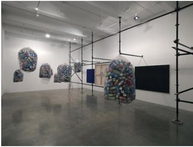
Claire Fontaine's Working Together, installation view, 2011

Maybe fittingly, it is best to end the essay with one of the last pieces in Working Together, a video of two men, one teacher and one student performing selfdefense techniques on one another. Mainly, the video depicts the teacher, who has some form of speech impediment (a hair lip?), awkwardly performing sad, action-hero type takedowns on the schlubby pupil. As I sat watching the video with a fellow visitor, I wasn't sure whether to feel shitty or laugh out loud (I did both). The video is ridiculous, the moves are ludicrous, and I couldn't help but wonder "what's the fucking point?!. The demonstration came out to nothing and, as a viewer, I certainly wasn't retaining anything so really, why? Therein lies the brilliance, the video is depicting exactly my experience in that Roberta Smith lecture, exactly my experience at so many show openings, exactly my experience thinking about the art market, exactly my experience experiencing this show performing