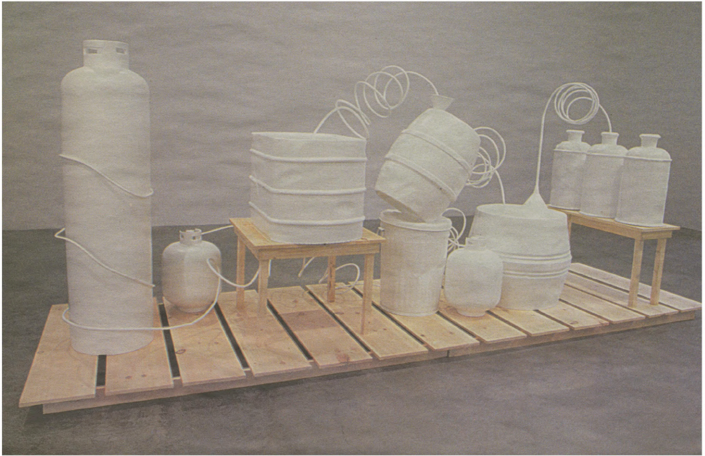
Big Still, 2001, Mixed Media

on. It's a fortune to have that base to draw on, as soon as I use my chalkboards, all of those things are already applied. So let's say I draw something like a roller coaster and it has a certain kind of political charge to it, but at the same time all of us have a recollection of going to amusement parks as children and so other things come into play as well.