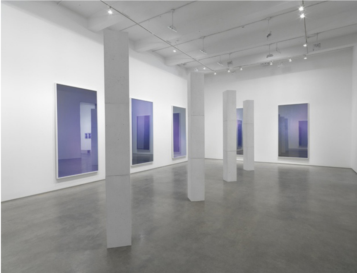
Installation view, Metro Pictures, New York, 2013.