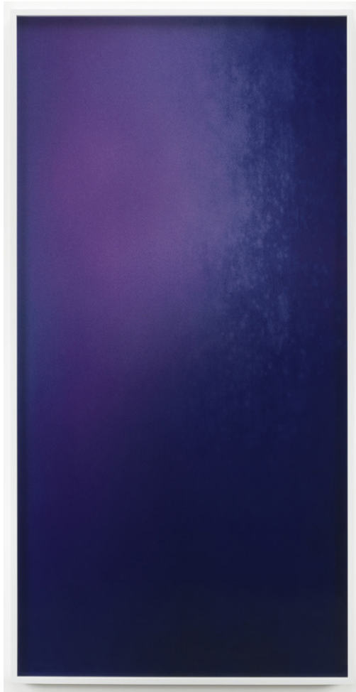
Sara VanDerBeek, Metal Mirror I (Magia Naturalis) , 2013.

BJS: You also were not encumbered with a lot of equipment.