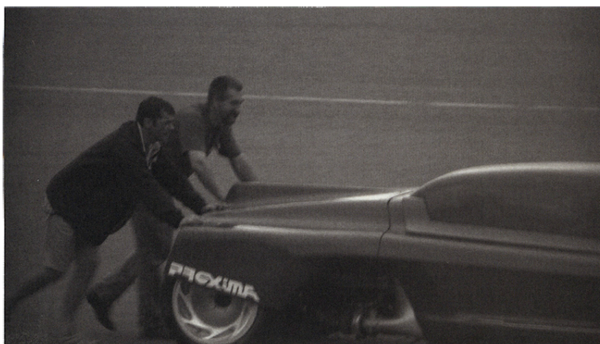
Out of Projection (film still), 2009

An exhibition of work by David Maljkovic is on view through 19 October at Metro Pictures, New York; Maljkovic's show Sources in the Air is at Galleria d'Arte e Contemporanea (GAMEC), Bergamo, from 4 October through 6 January