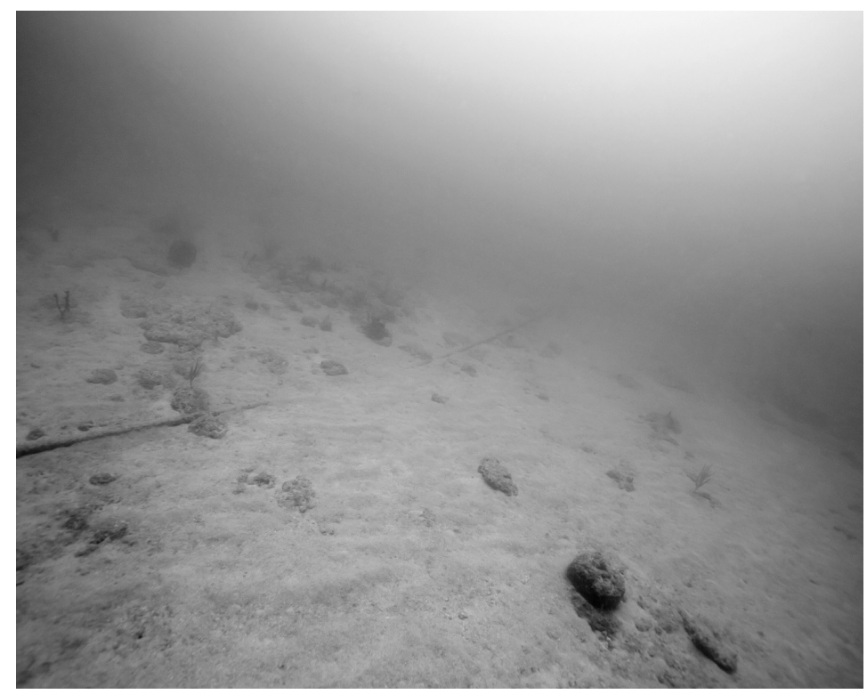
Trevor Paglen, Mid-Atlantic Crossing (MAC), NSA/CGHQ-Tapped Undersea Cable, Atlantic Ocean, 2015. C-print. 48 × 60 in.

image. No, this is a photograph of the fact that you can't see the stuff that's in this photograph.