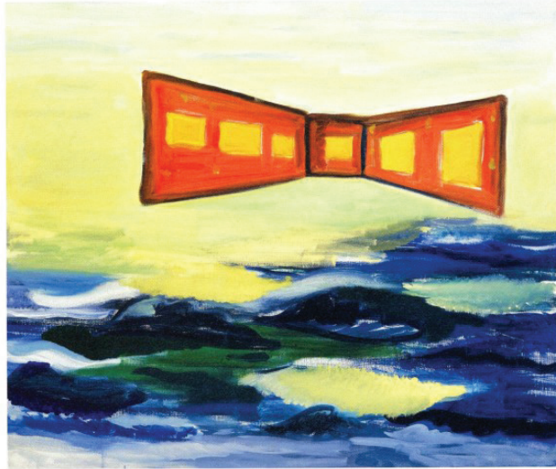
René Daniëls, "De Slag om de Twintigste Eeuw (Battle for the Twentieth Century)," 1984.

René Daniëls is a really, really good painter, maybe even a great painter, who stopped painting twenty-three years ago and has only resumed in the last two years. In 1987, he suffered a brain aneurysm from which he still hasn't fully recovered, and some of his recent work, shown alongside his '80s painting in the current show at the Camden Arts Centre, has a tentativeness you might expect from someone gradually returning to a loved activity. What must it be like for Daniëls, seeing his earlier paintings – richly colored, exuberant, mischievous oils – laid out here, with his more recent pieces – small-scale, scrawly felt-tip revivals of earlier motifs – dotted among them? It's a reminder, at least, that for an artist, the past is always present, like a rebuke.