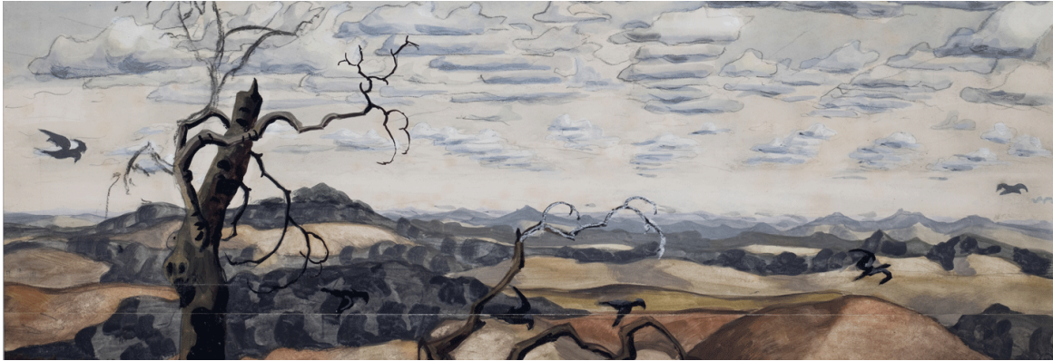
Detail of Charles Burchfield, Summer , 1926