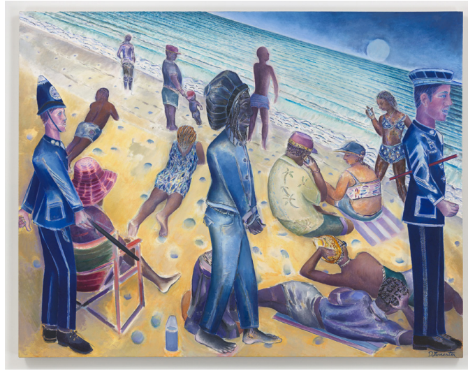
Denzil Forrester, From Trench Town to Porthtown , 2016

'Sputterances', as Daniëls defined them, are evident less in individual works than in the way one reads the exhibition as a whole – in fits and starts. Some of the works announce ('utter') their subjects while others are more elusive (they 'stutter'). For instance, in the latter category, Walter Swennen's Wind Blue (2015), a sparsely painted, pale blue ground peppered with swift grey charcoal marks and pentimenti visible underneath, resembles diagrams of weather patterns, and bridges Mathew Cerletty's What's The Feels Like (2017), a crisp and colourful rendition of a solar eclipse, with Daniëls's The Most Contemporary Picture Show (2006), a simple black and white oil painting of one planet orbiting another.