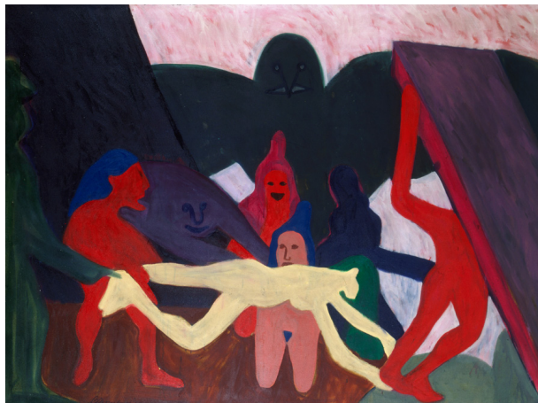
Bob Thompson, The Struggle , 1963

A cluster of small works on paper by Jonas Lipps are hung adjacent to a hallway that connects the gallery's two main exhibition spaces. One of these, the watercolour painting untitled (13-07-15) (2015), depicts a corridor that opens up into a room peopled by pink bodily forms. The work's composition echoes the viewer's own physical relation to the gallery, while its abridged geometry and rich green hues speak to the interior architecture found in Jacob Lawrence's nearby painting, Christmas in Harlem (1937). Each work on view deftly negotiates between surface appearance and symbolic content. Through his inclusions, Kantarovsky posits painting as a social medium by foregrounding the tussle between the sensuous and the dialectical.