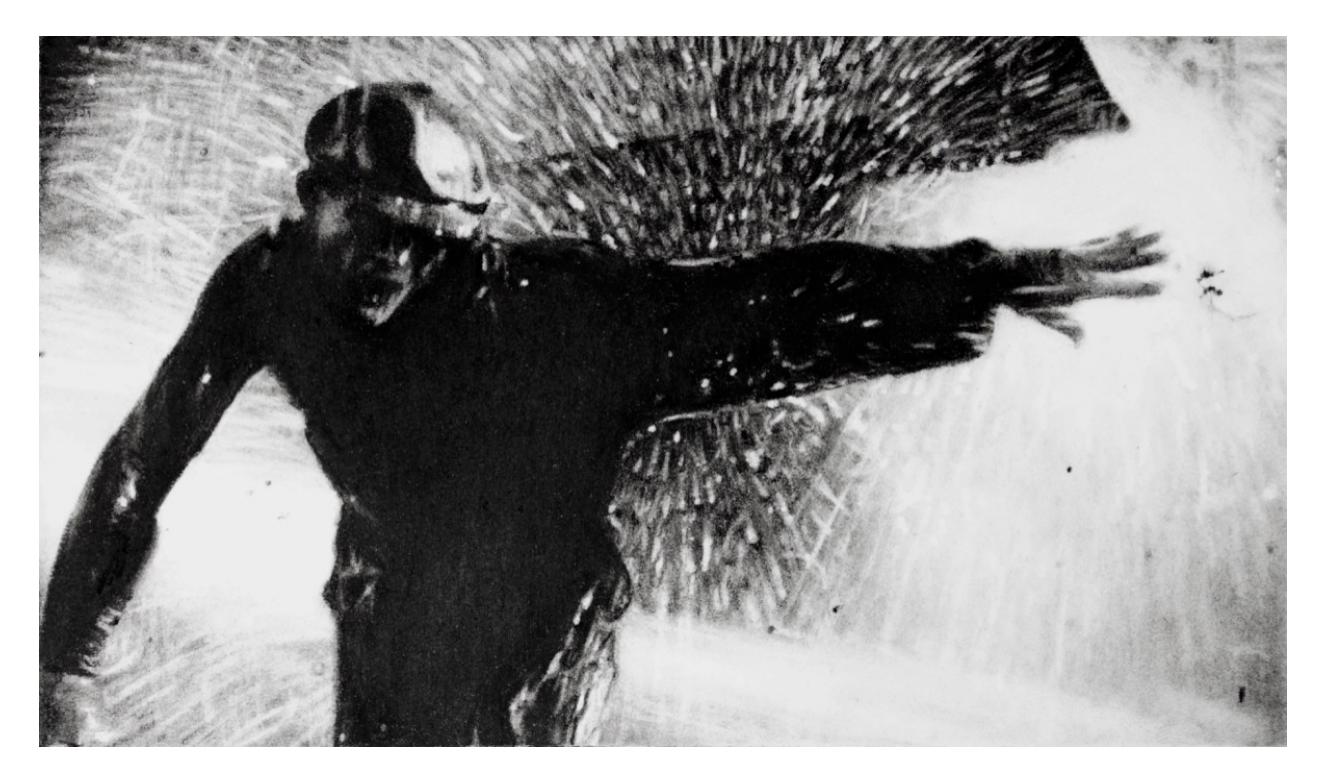
Robert Longo, Untitled (After Eisenstein, Strike, 1925), 2016.

Although the three artists are known primarily for different media, Longo chose to focus on Goya's etchings and Eisenstein's storyboards to underscore the fundamental importance of black-and-white drawing to them all. During two extensive research trips to Russia, Longo discovered that the State Central Museum of Contemporary History of Russia (formerly the Museum of the Revolution) in Moscow had a complete and pristine set of some 400 aquatint etchings from all four of Goya's major suites—a gift from Spain to Russia in appreciation for the country's aid in helping them try to fight off Franco.