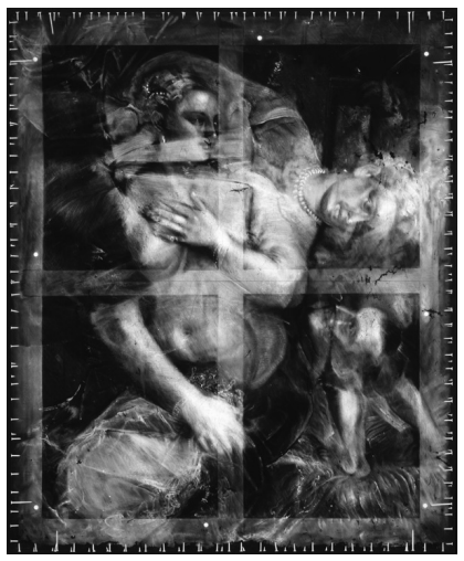
Robert Longo, Untitled (X-Ray of Venus with a Mirror, 1555, After Titian) , 2016-17. Charcoal on mounted paper, 110 × 92 in

This is a show that not only rewards close looking, but necessitates it. These images deal with systems of power and unrest, tradition and revolution; chiaroscuro is used both for drama and symbolism. Consider Longo's two recent protest drawings—Untitled (Black Pussy Hat in Women's March) (2017) and Untitled (Ferguson Police, August 13, 2014) (2014)—in the former, the viewer looks out from within the crowd towards a horizon glowing with hopeful light; in the latter, headlights silhouette riot police, indicating menace, danger. The white of Longo's page is equally potent in its symbolic roles as power or resistance. Critical to both Goya and Longo's work is an ambivalence rooted in the still frame of motion. Is Goya's Where There's a Will There's a Way (1813–1820) a celebration of man's ability to innovate to realize his dreams, or a nightmarish depiction of what we will become in the future? Is Kenny Britt's hand gesture in Longo's Untitled (St. Louis Rams/Hands Up) (2015) a signal of celebration or solidarity?