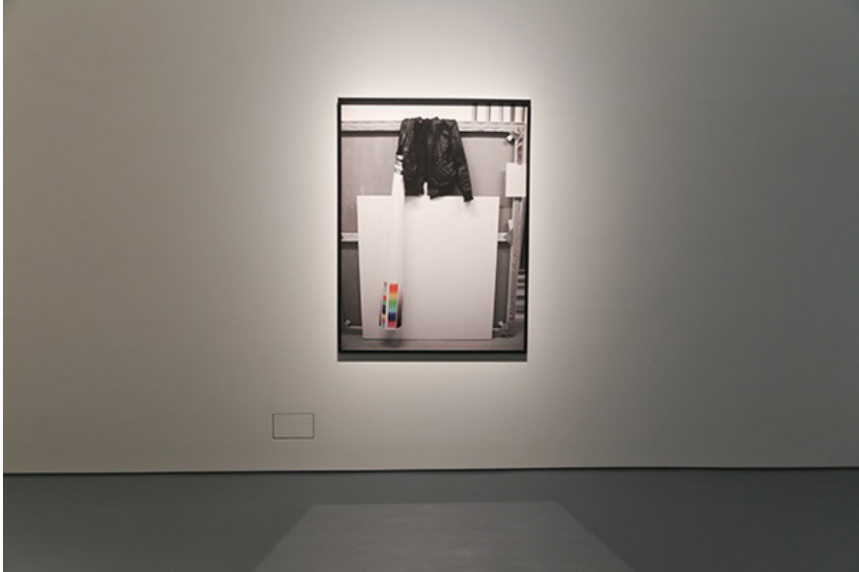
Untitled , 2012-2013

The exhibition presents an animation and video installation, a film projection, and a number of photographic collages and display forms that combine new works with remakes of previous ones from other series and exhibitions. In Afterform , 2013 (5:10 min.), the artist appropriates characters from a cartoon in a Croatian architectural magazine from the 1960s to create his first animation, with his own works inserted into the film. Projected on a screen set on a large white platform, under the rhythmic beat of what seems to be the sound of a mechanical clock, the animation presents several satirical characters playing absurd roles that involve Modernist forms: two men play a concentrated table game with rectangles; a waiter carries a building on a tray that later becomes an enlarged digital clock that crushes him; a snake charmer lures a form that successively transforms itself into the artist's works.