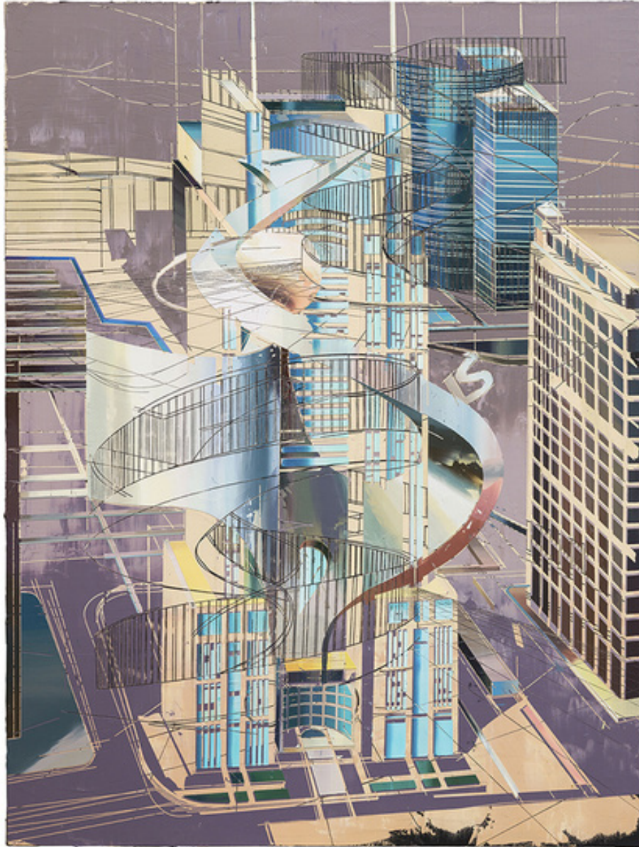
Cui Jie's Shanghai Bank Tower 2 , 2017, oil on canvas, 200 × 150 cm.

This led Cui to reimagine some of the important but dull buildings in her country, injecting flourishes into otherwise unremarkable edifices. Guangzhou Telecom Building (2017), a 3D-printed miniature copy of the titular office headquarters, carries the addition of three figures—arms outstretched, hair blowing in the wind—jutting out from one side of the tower, two of them taller than the building itself. There is a sense of grandeur that is normally reserved for victory monuments, at a scale intended to promulgate the importance of this locale. Cui does the same with several other office towers, marrying stellar or avian Art Deco elements with humdrum, blocky structures, and presents them in sketches or as 3D-printed sculptures.