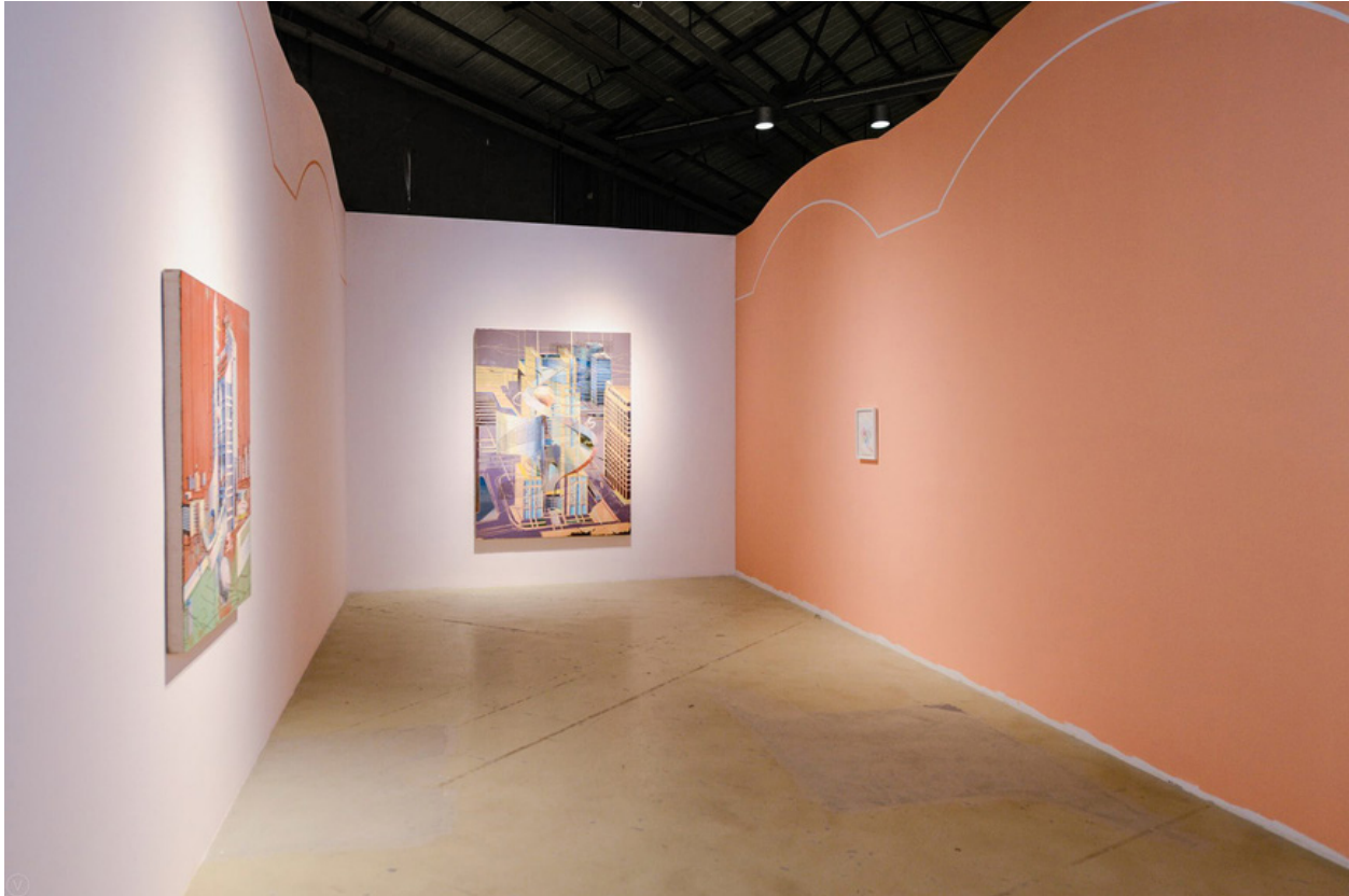
Installation view of "The Enormous Space" at OCAT, Shenzhen, 2018.