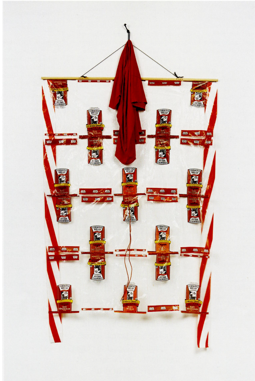
Untitled (bread quilt) , 2012, plastic bread bags, wood, string, thread, T-shirt, shoelace, caution tape, 203 × 114 cm.