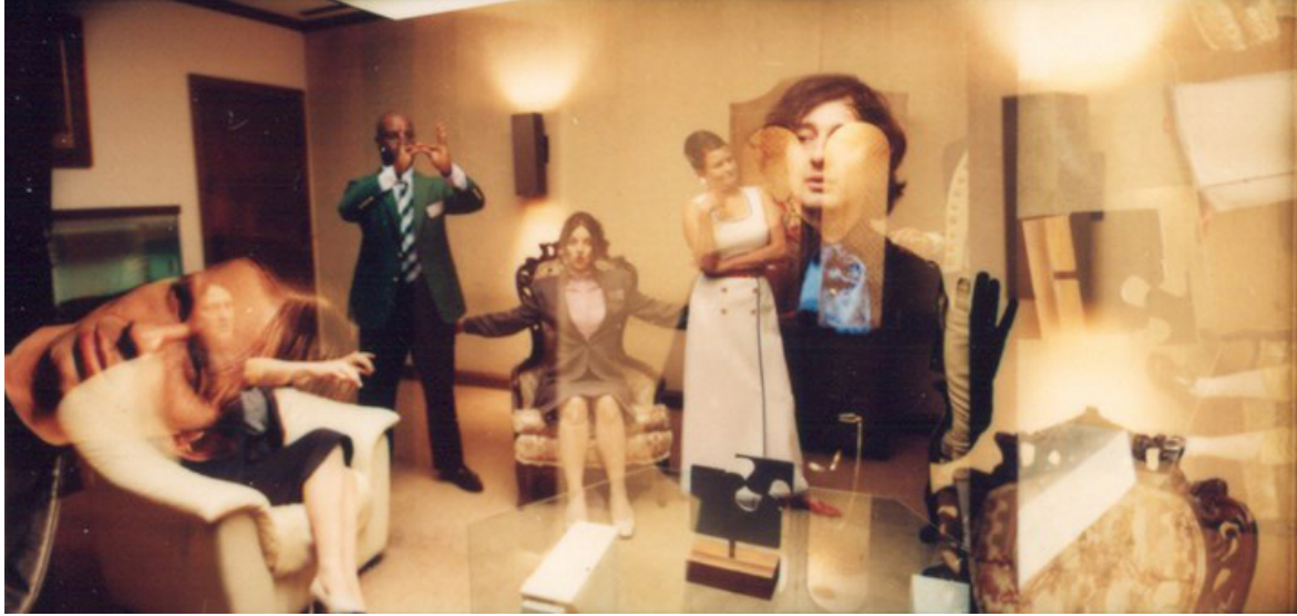
Catherine Sullivan, Misfire #10 (Manic Sincerity) (2005). Colour photograph. 42.5 x 89.5 cm.