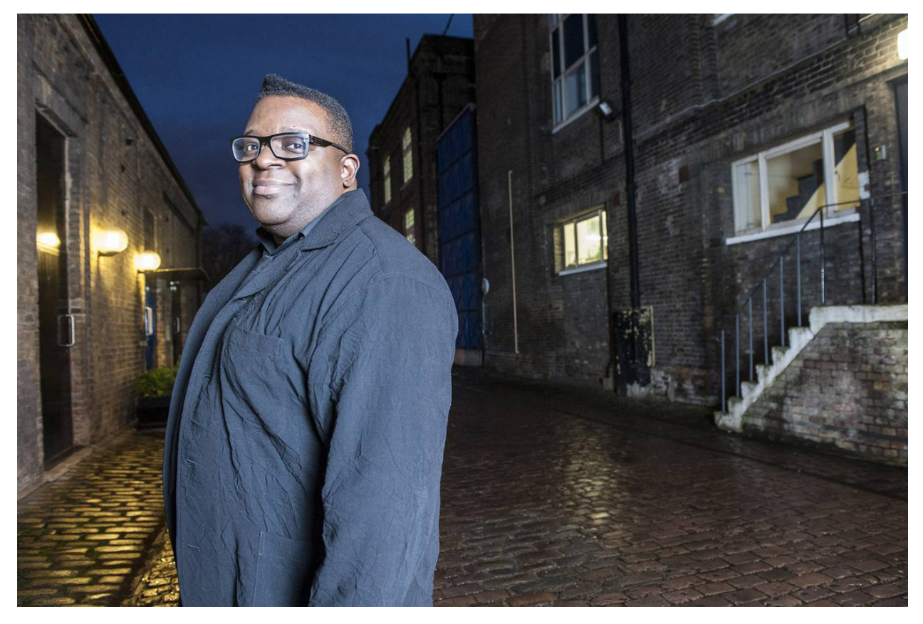
Making waves: renowned film-maker Isaac Julien

It is a cinematic epic with a crack cast by a black artist film-maker from London.