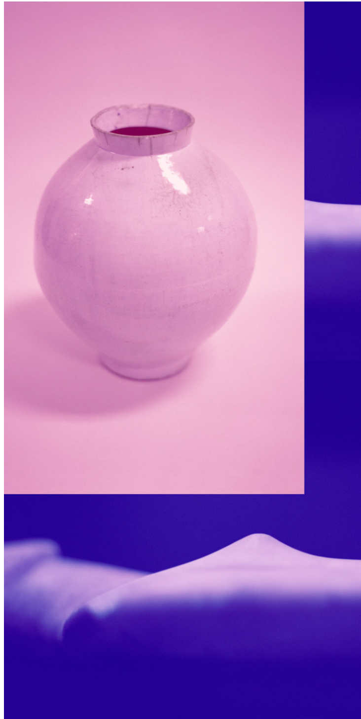
Women & Museums II, 2019. dye sublimation print.

The concept of blue light is related to the wavelength of light rays and the energy that they contain. In the light spectrum, blue-violet light rays have shorter wavelengths but the highest energy (right before ultra-violet light). Not as a physics expert, I'm coming to the conclusion that; having less visibility means more energy and having high visibility means less energy. I am left wondering if Sara VanDerBeek is trying to address questions of the visibility of women artists through color play.