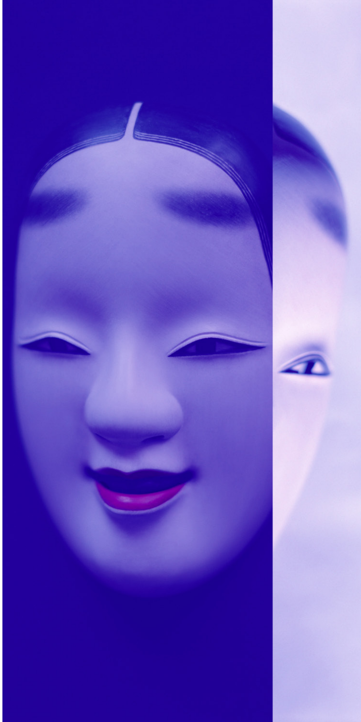
Women & Museums IV, 2019. dye sublimation print.

In a distinctively appropriate and brilliant way, Sara VanDerBeek makes me realize the potential of blue light in transmitting the power of women's work. In a way, she challenges the principles of physics and makes blue light highly visible, as well as highly powerful. This exhibit room is stimulating and electrifying, and gives us space to think about interpretation, histories, cultures and their relation from past to present.