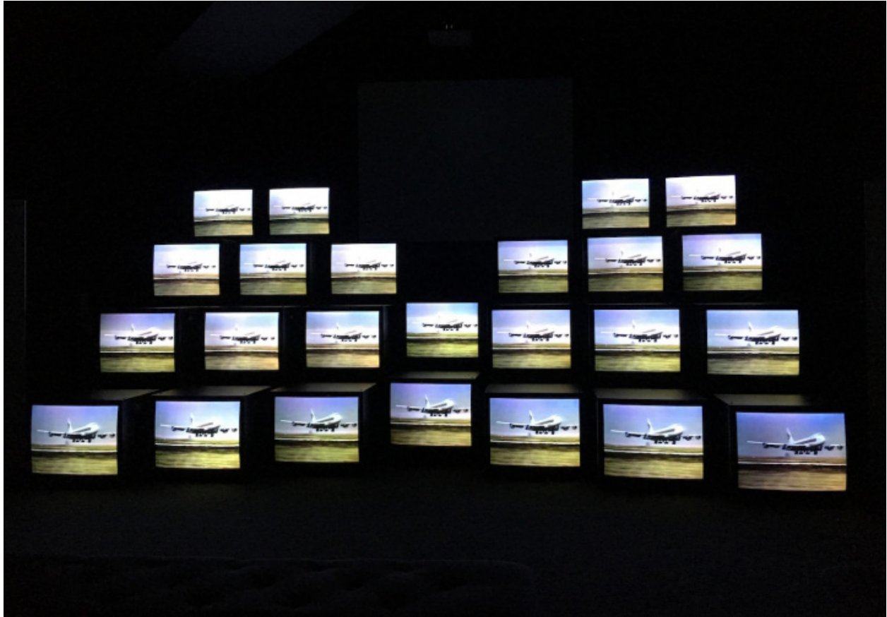
Gretchen Bender, "Total Recall" (still) (1987), 11-channel video installation on 24 monitors and 3 projection screens, 18.2 minutes, soundtrack by Stuart Argabright, dimensions variable

Gretchen Bender wanted to make a work of art that was so cutting edge that it told the future. It was the mid-1980s, and Bender's then-partner, Robert Longo, had recently shot to art-world stardom. Their apartment in Lower Manhattan was littered with state-of-the-art video equipment and stacks of Hollywood Reporter and Variety . The trade publications announced the titles of projects seeking financing or entering pre-production.