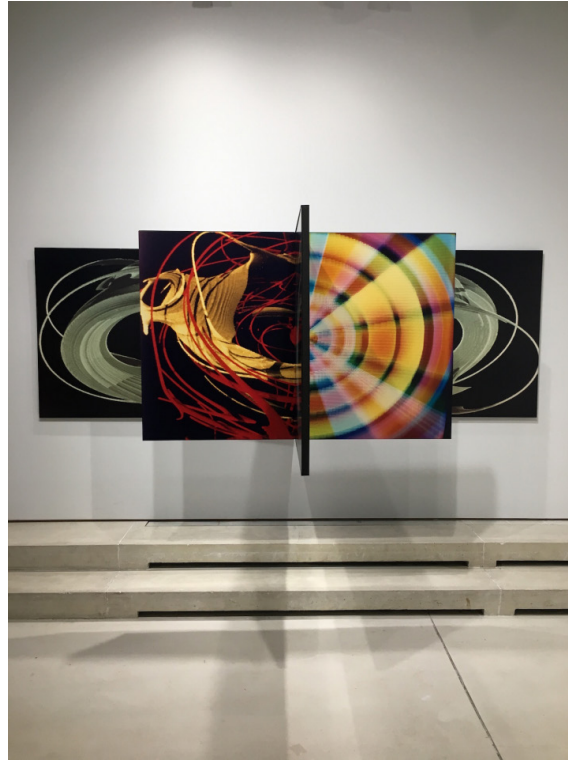
Gretchen Bender, "Untitled (Daydream Nation)" (1989), 12 laminated photographs, 40 x 120 x 60 1/2 inches

Tracking the Thrill effectively paved the way for So Much Deathless , currently on view at Red Bull Arts New York. Bender's first retrospective since 1991, it includes over 30 works created between 1982 and 2001. The show's overall scope, design, and ambition are extraordinary. It has been curatorially calibrated for maximum viewer engagement. Discreet touchscreens peppered throughout the show present concise oral histories by Denker, Longo, Vanderhyden, and many others. Burnished metal wall labels mirror the aesthetic of Bender's steel sculptures, their fonts sourced from the artist's exhibition materials.