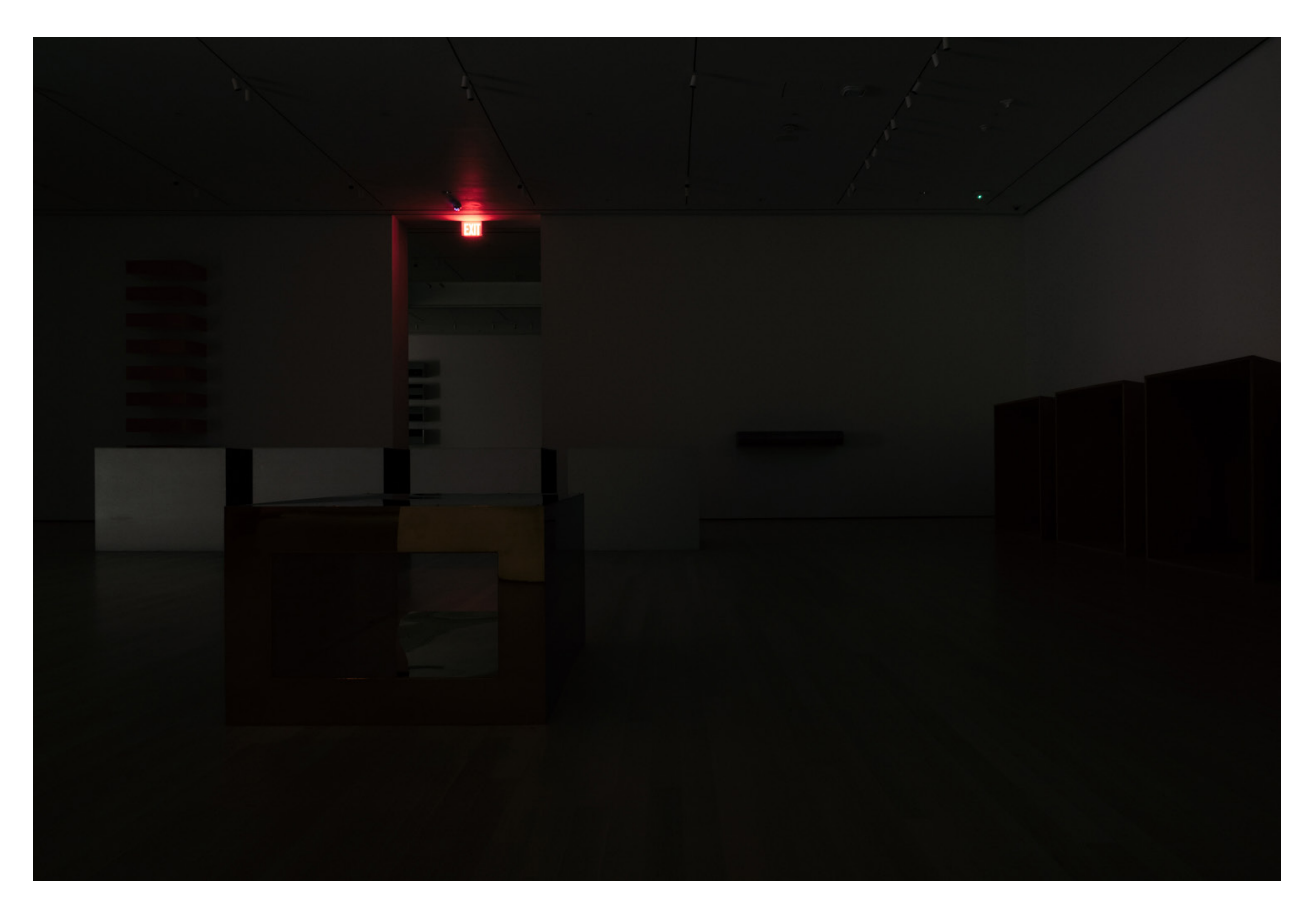
Louise Lawler, Untitled (Brass and Blue), 2021. Dye sublimation print on museum box, 48 x 71 inches.

Despite the solemn tenor of Lawler's photographs, a latent humor permeates the titles she has chosen for these works and, for that matter, the exhibition. While the images transport viewers into a tranquil environment, the fully capitalized title is that of a shout tearing through the quietude of the museum, betraying trespassing observers. The photographs' titles, though perhaps not overtly comedic, are akin to a joke shared amongst friends—poking fun at the ever-impractical naming convention strictly employed by Judd: Untitled (with an occasional, or museum-amended, parenthetical descriptor). Lawler's descriptors, which include ( MoMA ), ( Judd ), and ( Night ), prove no more helpful than a solitary Untitled , as each could be easily affixed to any of the works on view. For better or worse, they made me laugh, highlighting Judd's intentional (and even joyful) obfuscations—perhaps intended to promote an unmediated engagement between art object and viewer, one that isn't filtered through preconceived notions, external references, or curatorial narratives.