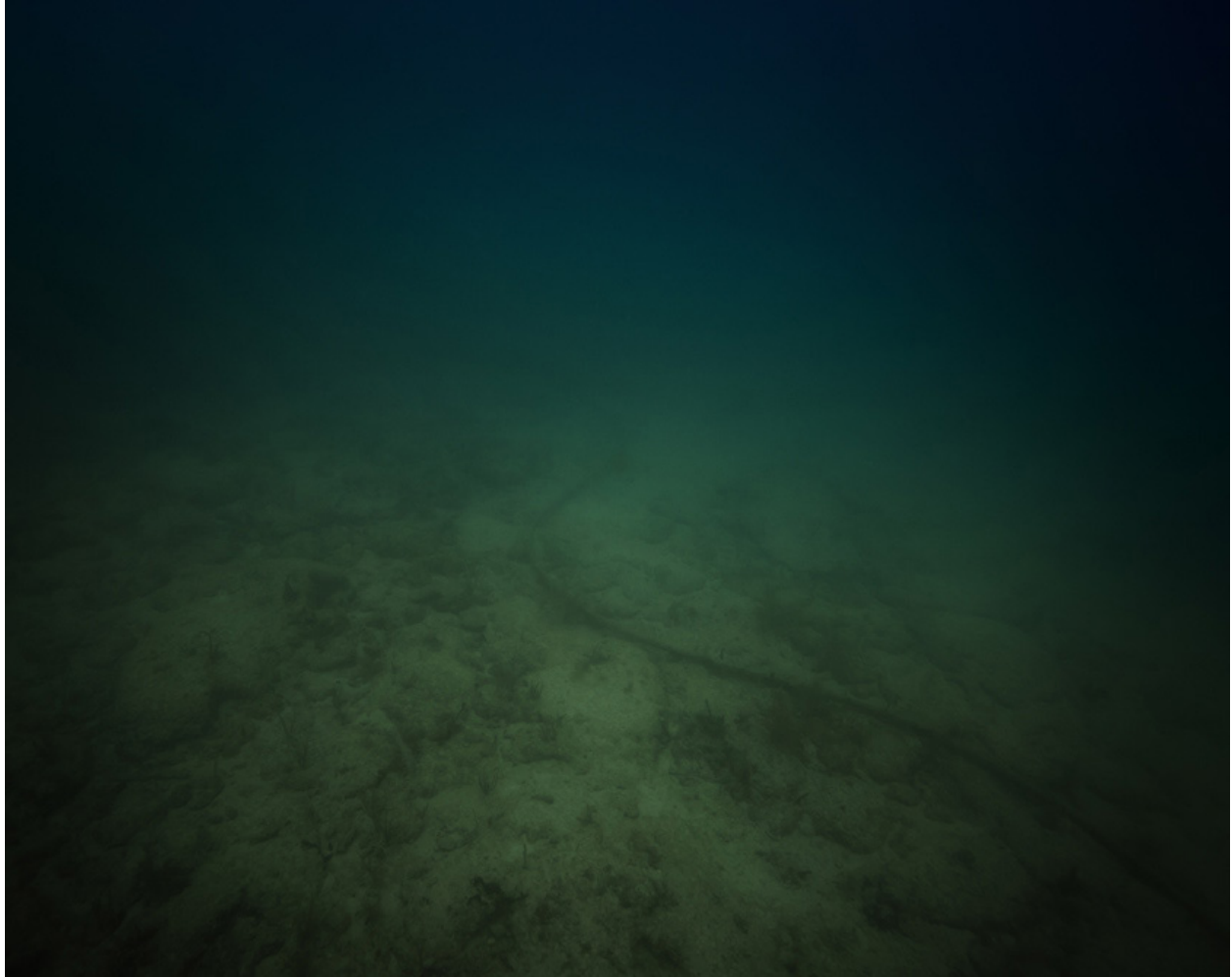
Globenet NSA/GCHQ-Tapped Undersea Cable Atlantic Ocean, 2015.

SMALL: Surveillance is definitely a way of keeping people in line.