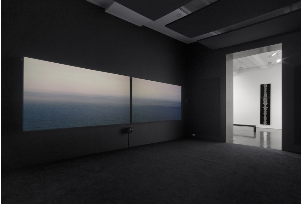
Eighty Nine Landscapes , 2015.

SMALL: So there are parallels with how this surveillance system developed.