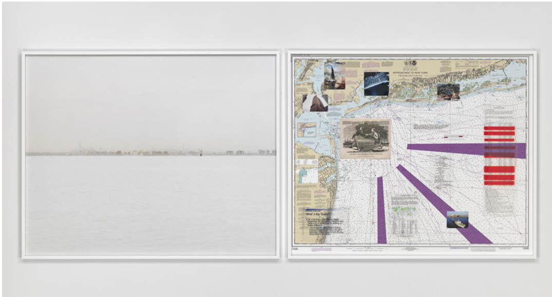
NSA-Tapped Fiber Optic Cable Landing Site, New York City, New York, United States, 2015.

The physical dimension of the Internet, documented through photographs, is the subject of artist Trevor Paglen's latest solo show at Metro Pictures in New York. With it, he aims to create awareness and incite public discourse surrounding the NSA's surveillance program, one of Paglen's focuses even before Edward Snowden went public in 2013.