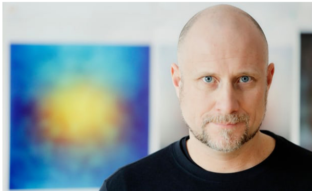
Trevor Paglen: 'You might think you know what it is, but I am going to tell you something different.'

His pictures, often shot at distances of many miles, are snapshots of the known unknowns of our world. As he explains his practice to me over the course of an afternoon, he runs through a dizzying sequence of illustrative images on his desktop computer. It is a slideshow punctuated by my asking: "What's that?" and him patiently explaining what we can see: a speck of a drone on the face of the sun; the white domes of the largest NSA station outside the US – at Menwith Hill near Harrogate; the beach at Bude in Cornwall under which a cable carrying the world's data makes landfall.