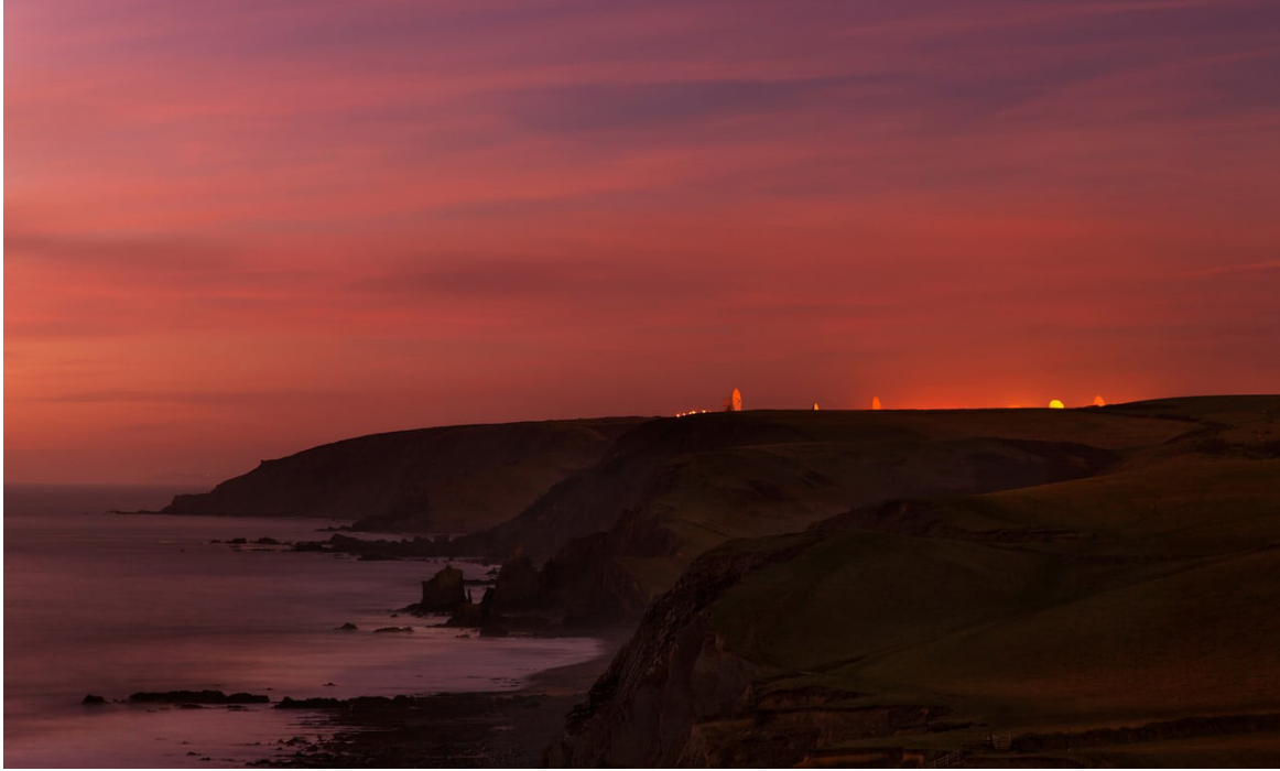
NSA/GCHQ Surveillance Base, Bude, Cornwall, UK, 2014. Paglen uses high-powered optics to capture classified military and surveillance bases.

Trevor Paglen describes himself as a landscape artist, but he is no John Constable. The landscapes Paglen frames extend to the bottom of the ocean and beyond the blurred edges of the Earth's atmosphere. For the last two decades, the artist, a cheerful and fervent man of 43, has been on a mission to photograph the unseen political geography of our times. His art tries to capture places that are not on any map – the secret air bases and offshore prisons from which the war on terror has been fought – as well as the networks of data collection and surveillance that now shape our democracies, the cables, spy satellites and artificial intelligences of the digital world.