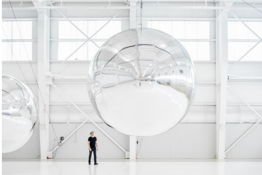
Prototype for a Nonfunctional Satellite , 2013. Part of a series exploring the idea of launching a decorative sculpture into the night sky. The object would remain in low orbit for several weeks before burning up on re-entry.

Paglen likes to joke that the airy apartment itself is probably one of the “most surveilled” spaces in western Europe. It was formerly home to the documentary-maker Laura Poitras, Paglen’s friend, who was instrumental in helping CIA whistleblower Edward Snowden go public about the staggering level of state-sponsored monitoring. Paglen’s footage of National Security Agency bases was included in Citizenfour , Poitras’s Academy award-winning documentary about Snowden. In some senses, being watched goes with the territory. The apartment is also a couple of hundred yards from the archives of the old East German Stasi: millions of pages of paper records in manila files that until recently would have represented the most comprehensive data collection in human history, before Facebook and Google, the NSA and the rest upped the ante.