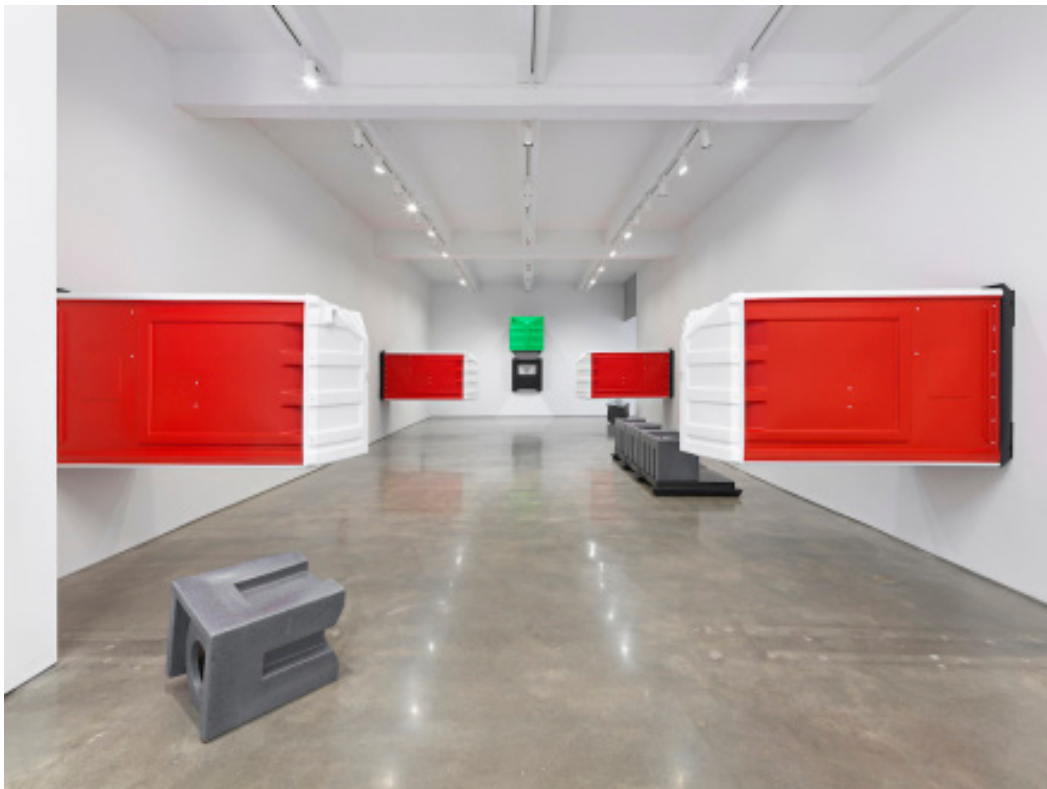
Andreas Slominski (Installation view)

Known for his intriguing humor and sleek aesthetic, German artist Andreas Slominski presents artifacts of consumerist desire in their most pristine forms, well before their wearing out over time through consumer use. His most recent exhibition at Metro Picture presents a group of fresh-from-the-factory portable plastic toilets, complete with stainless surfaces and bright colors. Instead of the foreseeable contrast they would orchestrate with a hygienic white cube space, these non-used bathrooms comply with the all-white atmosphere thanks to their immaculate exteriors and unusual display concepts.