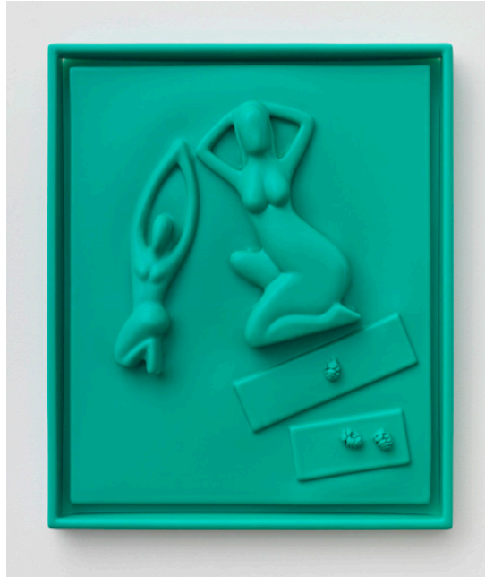
Andreas Slominski, Coal (2018)

Accenting his toilet sculptures are a series of wall reliefs created with the same plastic used during the production of toilets in different colors, including flashy greens and pinks. The images Slominski selected to be vacuum-formed onto these plastic surfaces are moments of maternal bond between mother and child. In addition to their commercial vibe with exaggerated and theatrical displays of connection, these silhouettes of women holding their babies recall “Mother and Child” iconography in Christian art. Throughout, the exchanges of utility and visual appeal are apparent, and the artist’s implication of the abject plays on past modes of capitalist critique while also commenting on the stark minimalism of the highest reaches of the modern art market.