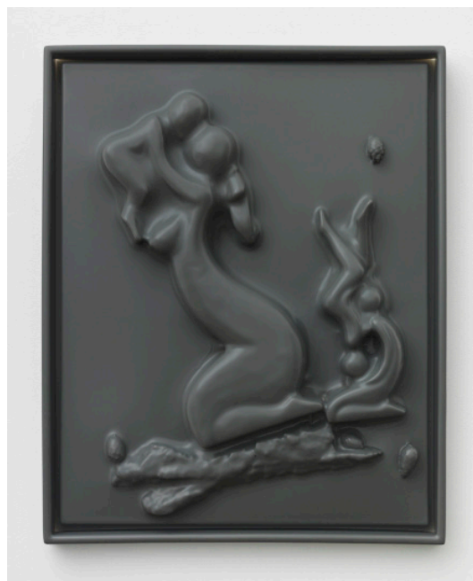
Andreas Slominski, Fish (2018)

Accenting his toilet sculptures are a series of wall reliefs created with the same plastic used during the production of toilets in different colors, including flashy greens and pinks. The images Slominski selected to be vacuum-formed onto these plastic surfaces are moments of maternal bond between mother and child. In addition to their commercial vibe with exaggerated and theatrical displays of connection, these silhouettes of women holding their babies recall “Mother and Child” iconography in Christian art. Throughout, the exchanges of utility and visual appeal are apparent, and the artist’s implication of the abject plays on past modes of capitalist critique while also commenting on the stark minimalism of the highest reaches of the modern art market.