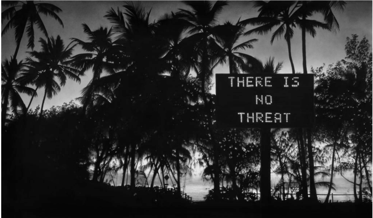
Robert Longo, Untitled (No Threat) (2018).