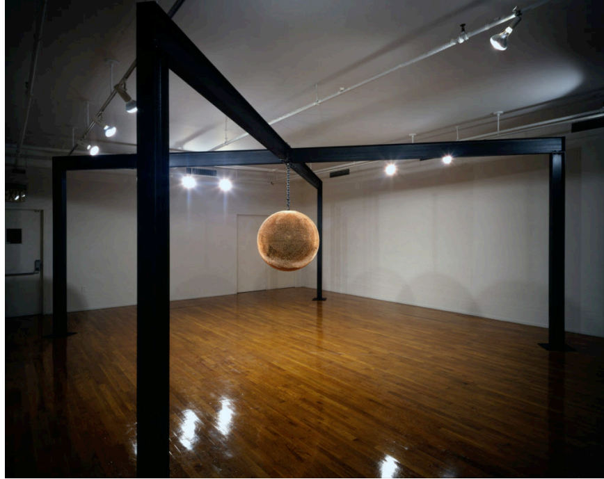
Robert Longo, Death Star (1993).