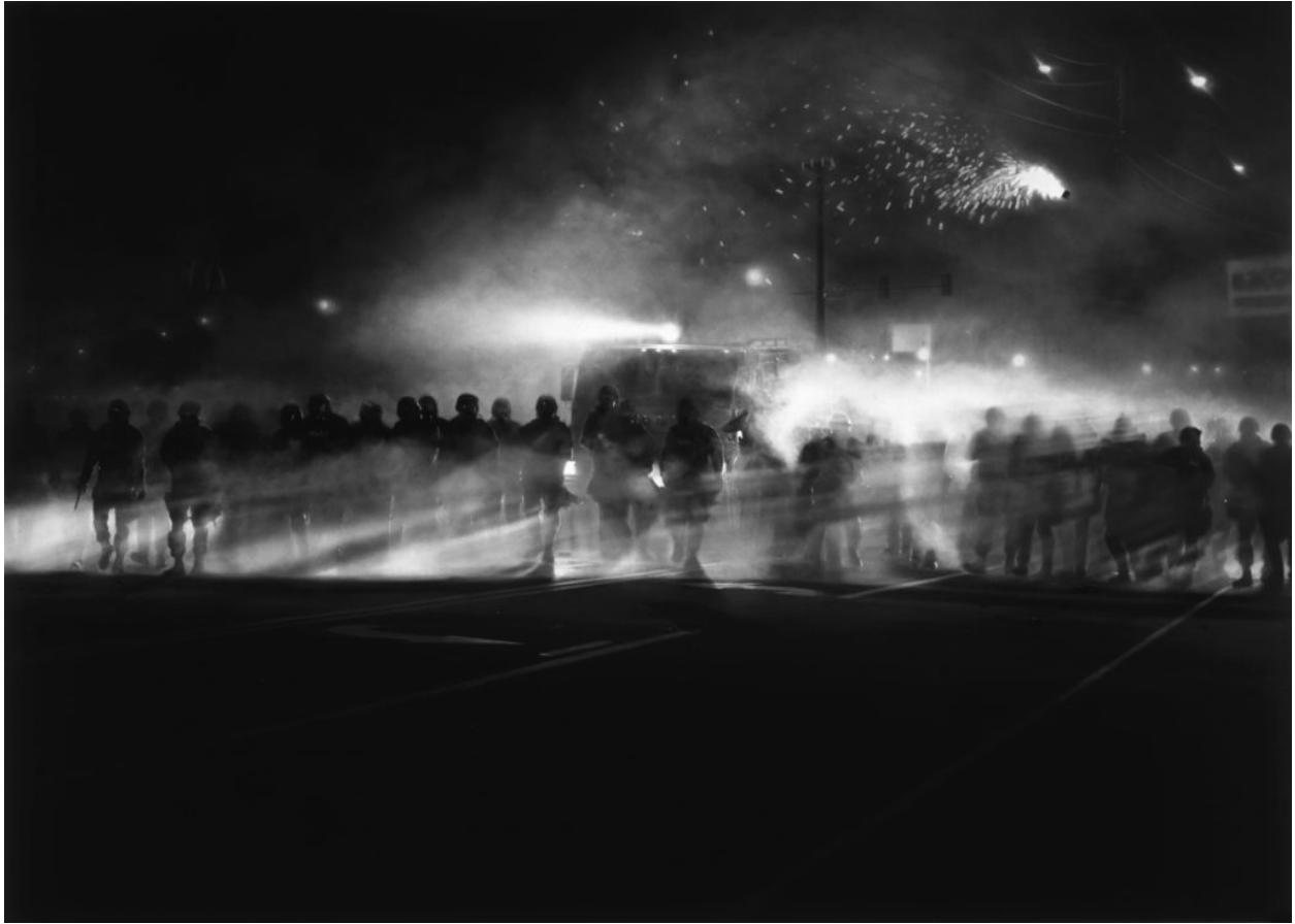
Robert Longo, Untitled (Ferguson Police, August 13, 2014) (2014).