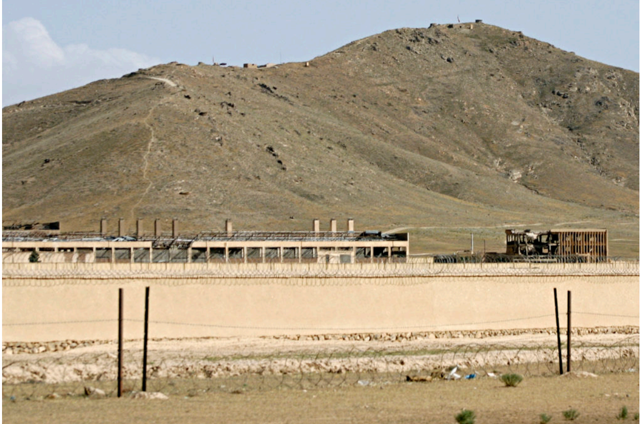
Trevor Paglen's The Salt Pit, Northeast of Kabul, Afghanistan (2006).

Let's start off by talking about the work that you're doing with machine learning and artificial intelligence. Your most recent show at Metro Pictures, "A Study of Invisible Images," included a number of photographs created by asking artificial intelligence programs to create images of various subjects—comets, vampires, or rainbows, for example. Were those works at all intended to remove the artist's hand from the production of the work?