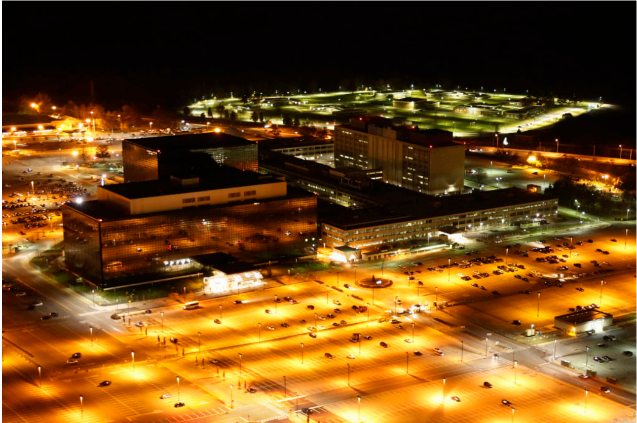
Aerial photograph of the National Security Agency by Trevor Paglen. Commissioned by Creative Time Reports, 2013.

That is a very simple example, whereas in real life you would build something like that for the back-end of Facebook, and when you upload a picture of you, Facebook will say, “There’s a picture of Brian drinking a Coke, wearing a Calvin Klein shirt,” so it can learn about you from the images that you post. Another application would be a self-driving car that can drive around and say, “I can recognize a stop sign, and there’s a tree, a person,” etc. What I do is build a taxonomy that instead of something like objects in your kitchen or things a car would see on the street or what Facebook wants to know about Brian, I’ll build a taxonomy based on something like literature or philosophy. I have one that’s called The Interpretation of Dreams . It goes through Freud’s book and picks up all of the symbols that Freud thinks are important about interpreting dreams, for example injections, puffy faces, scabby throats, windows, ballrooms, etc. When you point that camera around your kitchen, it no longer sees bananas and plates and spoons. It sees puffy faces, windows, and mothers. It sees the world through the eyes of psychoanalytic symbols.