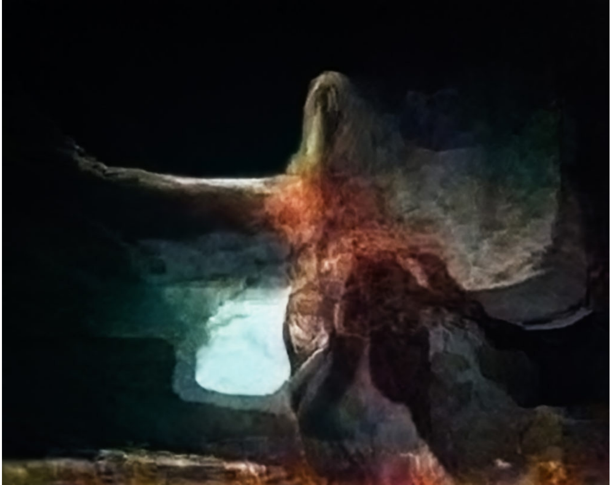
Trevor Paglen's Octopus (Corpus: From the Depths) , "Adversarially Evolved Hallucination" (2017).

I think of clarity and blurriness as almost epistemological genres. They do different kinds of work. When you see something that's really clear, you imagine that you can understand it. Seeing something very blurry forces you to confront that you don't really understand the thing. You have to imagine something into the image, because it doesn't speak for itself. Probably the most photorealistic images that I've made are images of beaches—places where the NSA is tapping transcontinental fiber optic cables. Everything is clear, but the irony is that the thing I'm photographing is actually invisible.