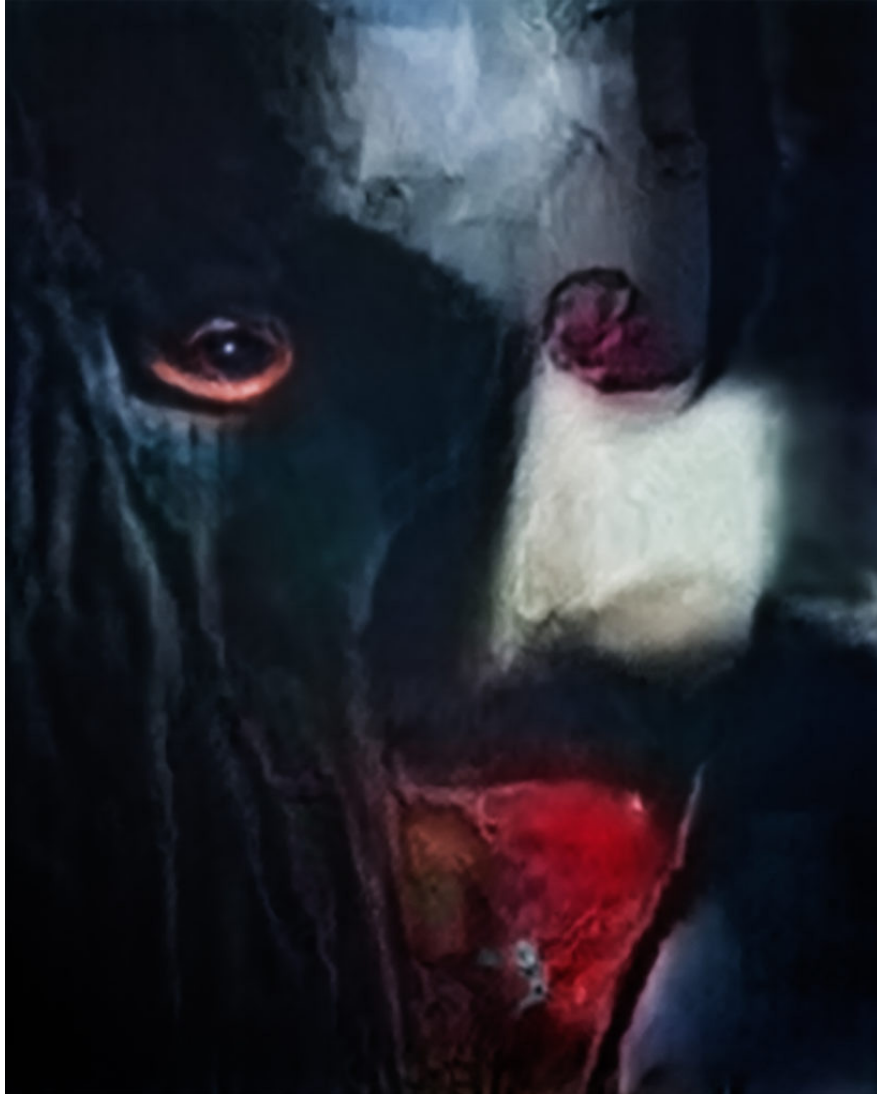
Trevor Paglen's Vampire ( Corpus: Monsters of Capitalism ), "Adversarially Evolved Hallucination" (2017).

Paglen's work has variously involved a satellite that orbits the Earth, serving no military, surveillance, or communications purpose, sent aloft only to reflect light back to Earth; a team of scuba divers who mapped the fiber-optic cables that transmit data to and from computers and telephones on distant continents—information that's swept up in government surveillance efforts; and a piece of computer circuitry standing inside a Plexiglas box in an art gallery, where it creates a wireless network for gallery visitors to use, and one whose traffic is protected from surveillance efforts with open-source anonymizing software.