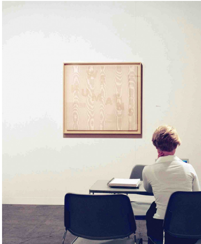
Louise Lawler, "Not Cindy" (2002/2008)

And with the same passage of time, the institutional critique that the Pictures Generation inherited from Conceptual Art has spread into the wider world with the emergence of groups such as Occupy Museums and Global Ultra Luxury Faction (G.U.L.F.), and in the calls for more diversity in museum collections, exhibitions, staffing, and administrations. In some cases, cultural ethics have become public policy, as seen in governmental repatriation efforts and the reclamation of art looted by the Nazis.