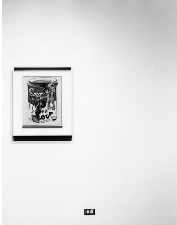
Louise Lawler, "Soup Can" (2005/2006)

The adjusted to fit abstractions lay bare the classical elegance undergirding Lawler's compositions, accentuating the importance of horizontal and vertical alignments and the disorienting effects of diagonals and curves. In "Wall Pillow" (2010/2012), depicting the verso of a work by Gerhard Richter, the irregular, high-contrast black shapes on the white backing are strikingly pure and simply arranged, lending the image a graphic crispness, while a piece like "CS #204" (1990), which frames a self-portrait by Cindy Sherman between two other artworks, one of which is wrapped in plastic, possesses a painterly lyricism rendered deeply troubling by the jackknifing of Sherman's left arm.