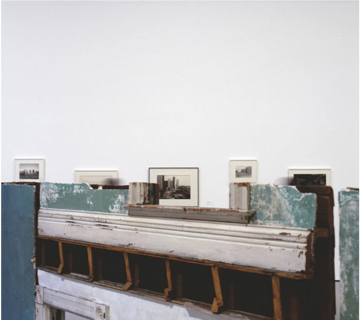
Louise Lawler, "Cities" (2004/2005)