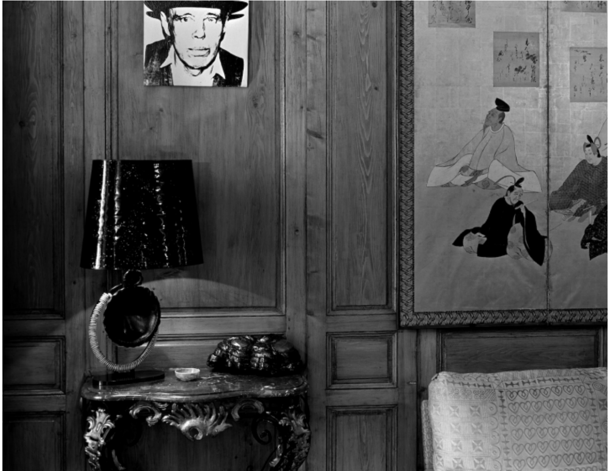
Louise Lawler, "It Could Be Black and White" (1994/1996)

It was also her intention (consistent with her practice's focus on the provenance) that the catalogue's title page be immediately followed by a listing of photographs acquired by Verbund, including the date of purchase and name of seller, a form of documentation usually relegated to the back of the book, if included at all.