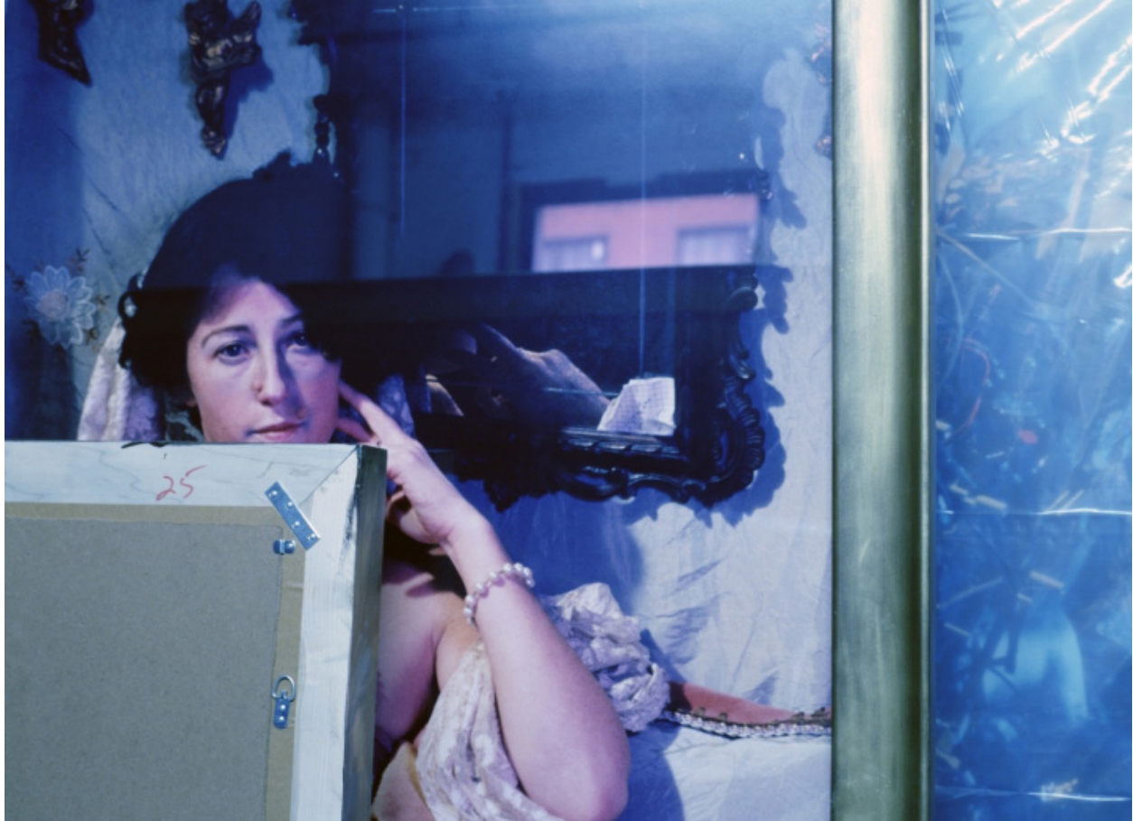
Louise Lawler, "CS #204" (1990)

The Vertical Gallery of the Sammlung Verbund is just that — a stacked exhibition space comprising stairs and lobbies at the headquarters of Verbund AG, Austria's leading electricity company.