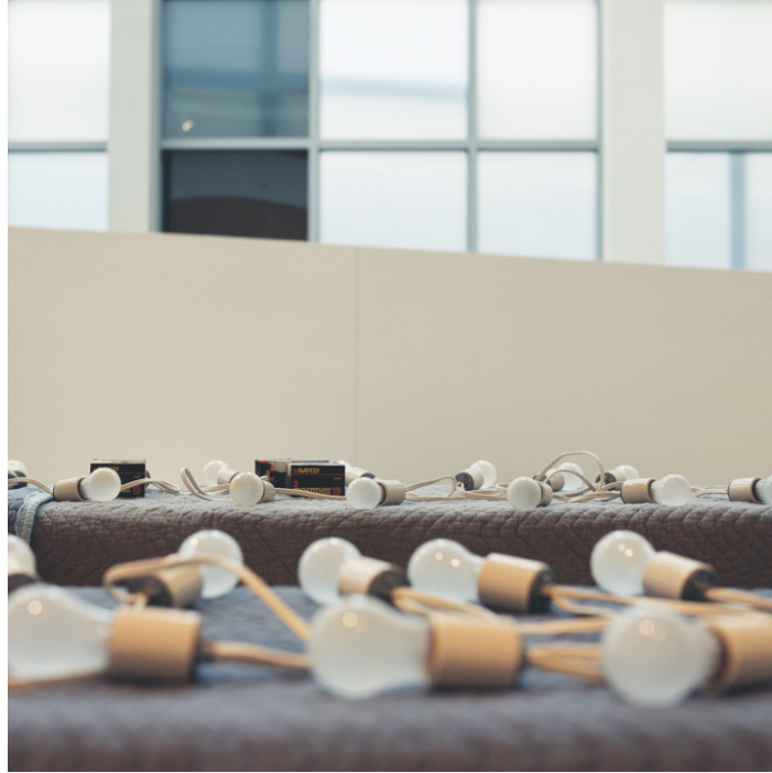
Louise Lawler, "Bulbs" (2005/2006)

In light of this exhibition, Lawler's critique seems harder to pin down than ever, perhaps due to shifting times as much as curatorial selection.