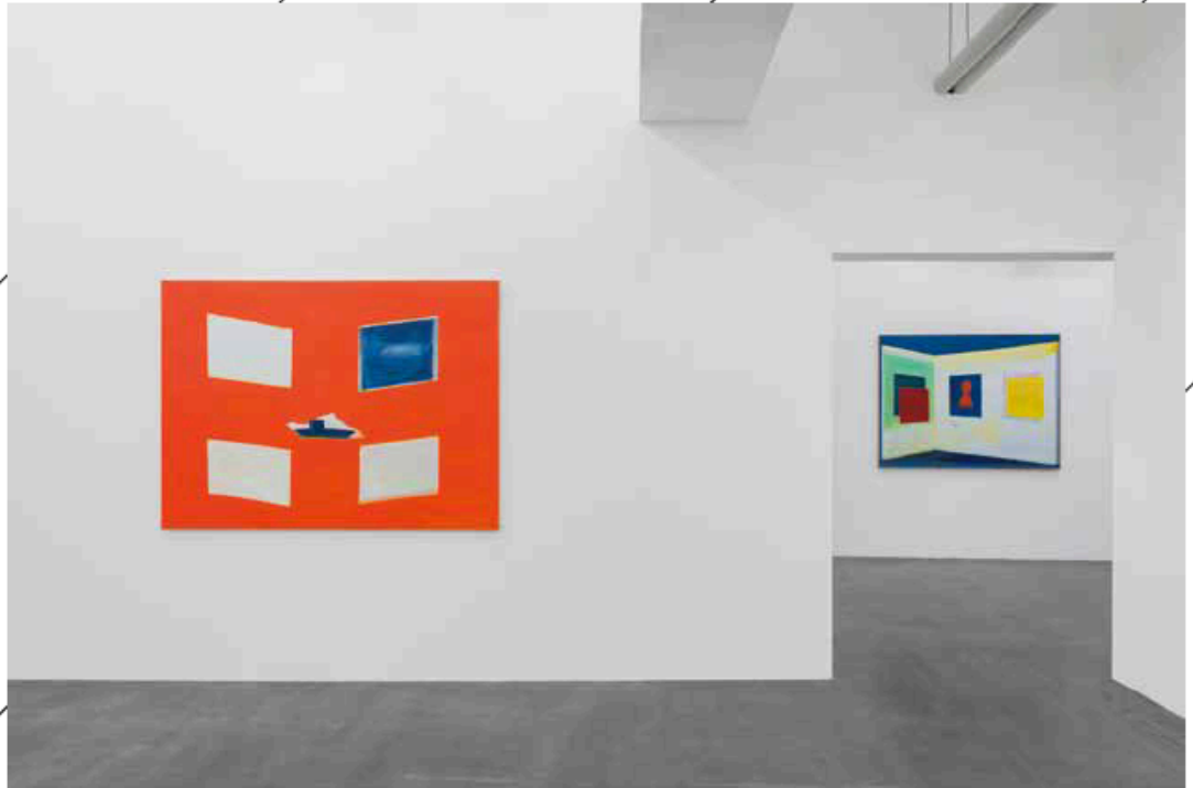
René Daniëls, „Fragments from an Unfinished Novel“, WIELS, Brussels, 2018 Exhibition views