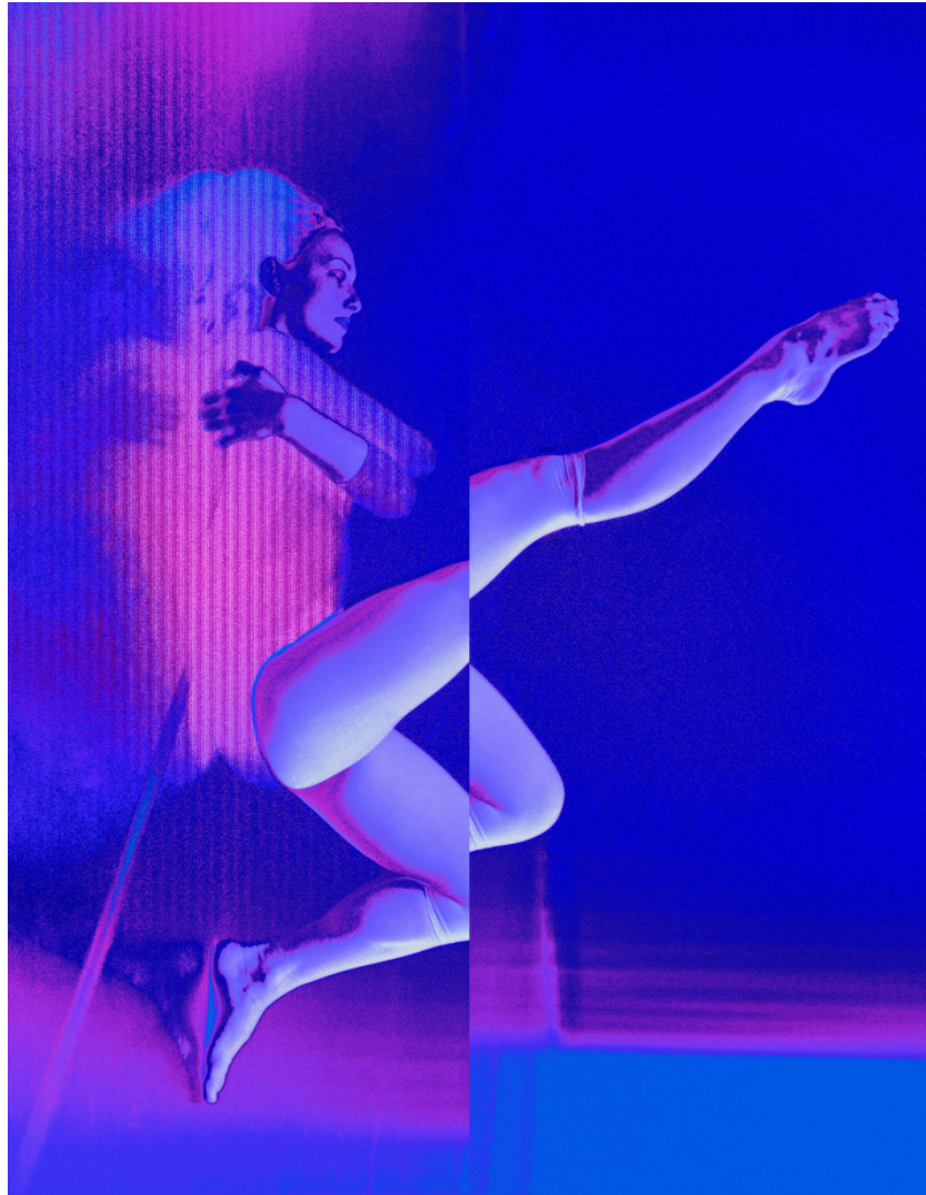
Sara VanDerBeek, "Baltimore Dancers Twelve" (2019), digital C-print, 20 x 15 3/4 inches.

VanDerBeek began his experimental film work in the 1950s, not long after leaving Black Mountain. His films and videos often incorporate wildly eclectic imagery — combining found footage, animation, still imagery, and riotous soundtracks — all moving at an exhilaratingly frenetic pace; a paradigmatic example is his 1963 tour de force Breathdeath , on view in this show. VanDerBeek observed that he was simply following the rhythm of his times. In the 1968 documentary film VanDerBeekiana: Stan VanDerBeek's Vision , he declared: "Culture is moving into what I call a 'visual velocity.' Sometimes I wake up and think to myself: It looks like it's going to be a 60-mph day." In an effort to cram as much experience as possible into the dizzying moment, in the mid-1960s he invented his Movie-Drome, a vast, dome-shaped audiovisual laboratory built in Stony Point, New York, in which multiple film projections could be experienced simultaneously. Investigating the intersections of art, technology, and communication, he understood the power of television and foresaw the then-nascent potential of computers, fostered by stints as artist-in-residence at Bell Labs, MIT, and NASA.