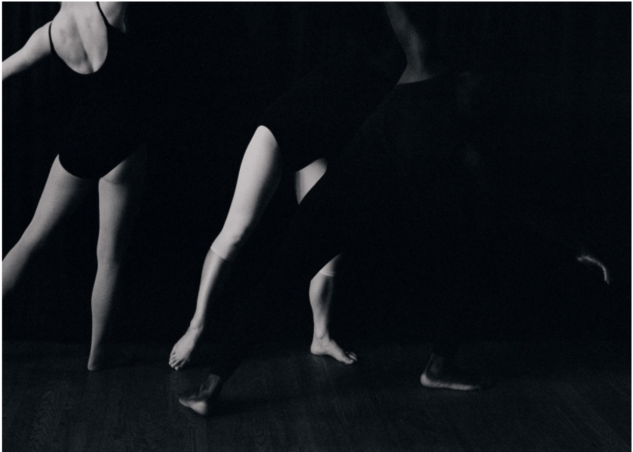
Sara VanDerBeek, "Baltimore Dancers Six" (2012), digital C-print, 6 x 8 inches (image); 16 1/4 x 16 1/2 inches (frame).

VanDerBeek + VanDerBeek at the Black Mountain College Museum + Arts Center in Asheville, North Carolina, brings together works by the late experimental filmmaker (and polymath) Stan VanDerBeek and his daughter, photographer (and fellow polymath) Sara VanDerBeek, who is also the exhibition's co-curator. Although their careers never coincided — Stan died in 1984, when Sara was seven — the show identifies areas of conceptual and visual overlap between father and daughter, and feels very much like a collaboration between artists.