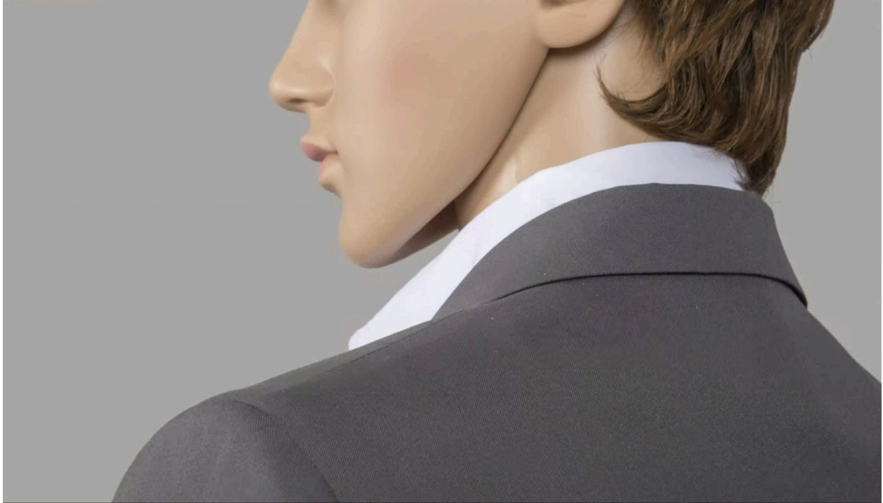
John Miller, What Is a Subject? (film still), 2020. Video with color and sound, 11 minutes 5 seconds.

Miller's exhibition "The Collapse of Neoliberalism" was at the gallery back in February, taking as an icon the mannequin as a vessel of human identification and consumerist projection. His video Toll Free (2019) screened in the back gallery, and it's now part of the three available online. Running just over six minutes, images of a mannequin's frozen face, disembodied arms and hands, and a series of office desk phones temporarily obstruct rotating camera footage of the busy junction of Church Street and Sixth Avenue in Tribeca. Audio of busy signals, answering machine prompts, and the automated gargle of robocall scams drone on, the anxious ambient noise that punctuates a normal day—or what counted for one, once—the fatigue of commuting to work or not-work, screening and decoding the questionable incoming data on your personal device. I was jealous, again. That mannequin was in Manhattan.