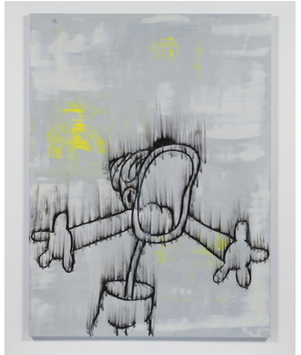
Image: Gary Simmons, Screaming Into The Ether , 2020, oil and cold wax on canvas, 96 1/4 x 72 1/4 inches, 244.5 x 183.5 cm.

Follow the gallery on Instagram @metro_pictures