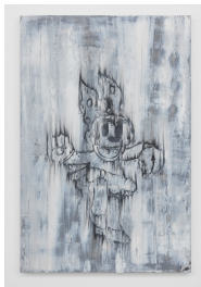
Dance Little Sister , 2020 oil and cold wax on canvas 72 x 48 inches 182.9 x 121.9 cm (MP# GS--307)