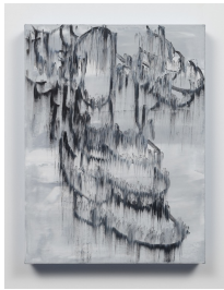
Tippy Tippy Tap Tap , 2020 oil and cold wax on canvas 24 1/4 x 18 1/4 inches 61.6 x 46.4 cm (MP# GS--317)