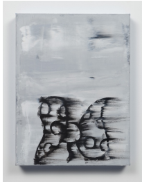
The Bow , 2020 oil and cold wax on canvas 24 1/4 x 18 1/4 inches 61.6 x 46.4 cm (MP# GS--316)