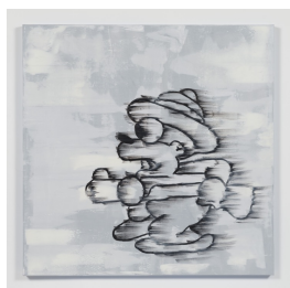
On the Hunt , 2020 oil and cold wax on canvas 60 1/4 x 60 3/8 inches 153 x 153.4 cm (MP# GS--315)