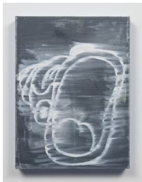
Screaming For Vengeance , 2020 oil and cold wax on canvas 24 1/4 x 18 1/4 inches 61.6 x 46.4 cm (MP# GS--318)