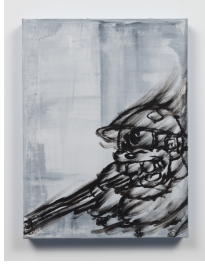
Survival Tactics , 2020 oil and cold wax on canvas 24 1/4 x 18 1/4 inches 61.6 x 46.4 cm (MP# GS--323)