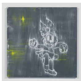
North Star , 2020 oil and cold wax on canvas 60 1/4 x 60 3/8 inches 153 x 153.4 cm (MP# GS--312)