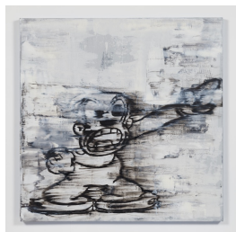
More To The Point , 2020 oil and cold wax on canvas 60 1/4 x 60 3/8 inches 153 x 153.4 cm (MP# GS--313)