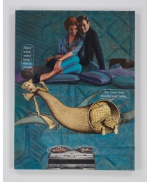
Long About Now , 2021 acrylic on muslin 48 x 36 inches 121.9 x 91.4 cm (MP# JS--344)