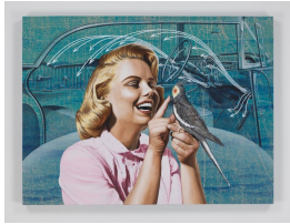
The Famous Flower of Serving Man , 2021 acrylic on muslin 36 x 48 inches 91.4 x 121.9 cm (MP# JS--330)