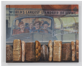
The Bridge , 2021 acrylic on muslin 48 x 60 inches 121.9 x 152.4 cm (MP# JS--329)