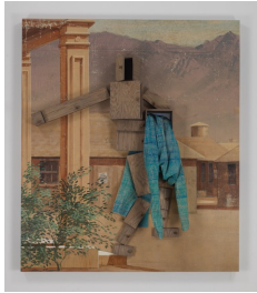
Based on the film "The Cabinet of Dr. Caligari" , 2021 acrylic and wood on muslin 72 x 62 inches 182.9 x 157.5 cm (MP# JS--327)