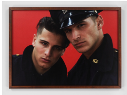
He-Ji Shin Protegee Protector 2 , 2018 inkjet print 21 x 29 1/2 inches (image) 53.3 x 74.9 cm 22 1/8 x 30 5/8 inches (frame) 53.3 x 74.9 cm Edition 1 of 2, 1 AP (MP# HJS--3)