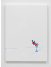
Nash Glynn If You Were a Cup , 2021 acrylic on canvas 40 x 30 inches 101.6 x 76.2 cm (MP# NGL--1)