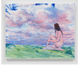
Nash Glynn Untitled (Self-Portrait) , 2021 acrylic on canvas 24 x 30 inches 61 x 76.2 cm (MP# NGL--3)