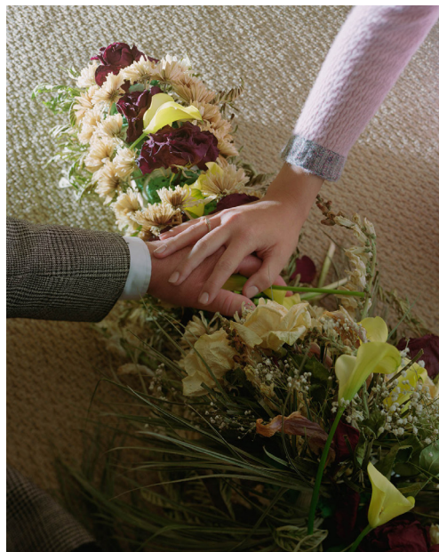
Image: Torbjørn Rødland, Floor Flowers , 2015. Chromogenic print, 30 x 23 5/8 inches (76.2 x 60 cm).

Heji Shin photographed male models in NYPD uniforms and staged a porn shoot to make her series "Men Photographing Men." The works engage the familiar "man in uniform" trope commonly enacted in, for example, the banal ritual of the bachelorette party. The porno cops arrive on the scene to titillate, whether to satisfy a rescue fantasy or, conversely, a masochistic desire to be punished and subjugated.