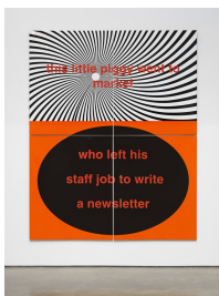
Nora Turato This little piggy went to market , 2021 vitreous enamel on steel, four elements 94 1/2 x 75 5/8 inches (overall) 240 x 192 cm (MP# NT--11)